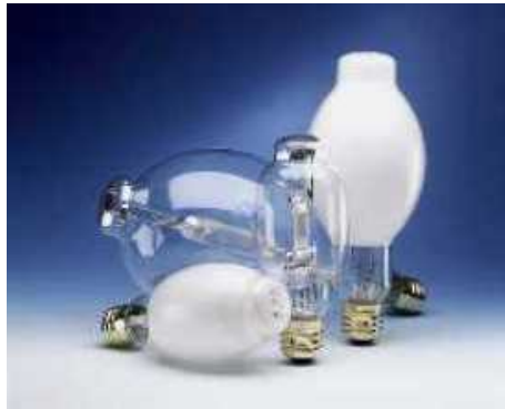
Metal Halide Bulbs