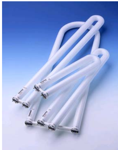
U Shaped Fluorescents