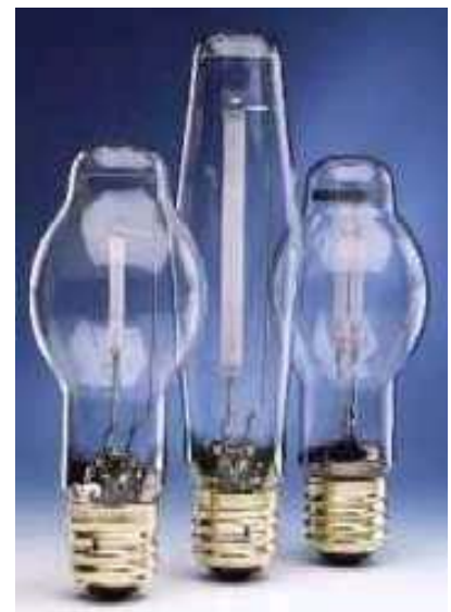
High Pressure Sodium